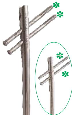
Option - I