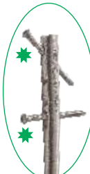
Option - II

Locking Bolt \phi 5.0mm Locking Bolt \phi 6.5mm